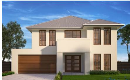
Optional facade available

Visit one of our display homes for more information. Full list of locations available on our website