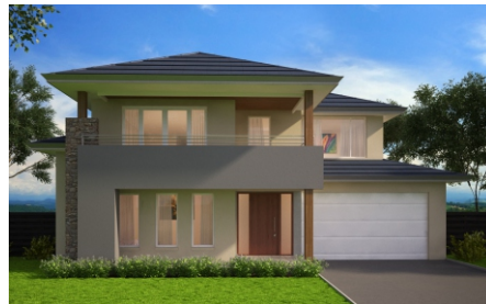
Optional facade available

Visit one of our display homes for more information. Full list of locations available on our website