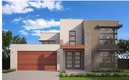
Optional facade available

Visit one of our display homes for more information. Full list of locations available on our website