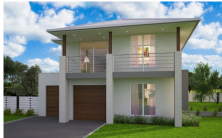
Optional facade available

Visit one of our display homes for more information. Full list of locations available on our website