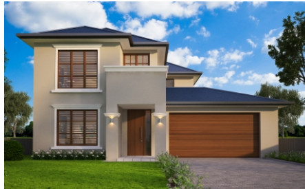
Optional facade available

Visit one of our display homes for more information. Full list of locations available on our website