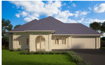
Optional facade available

Visit one of our display homes for more information. Full list of locations available on our website