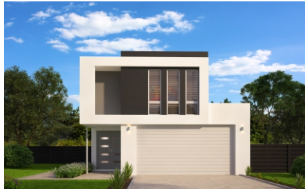
Optional facade available

Visit one of our display homes for more information. Full list of locations available on our website