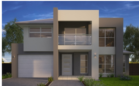
Optional facade available

Visit one of our display homes for more information. Full list of locations available on our website