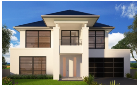
Optional facade available

Visit one of our display homes for more information. Full list of locations available on our website