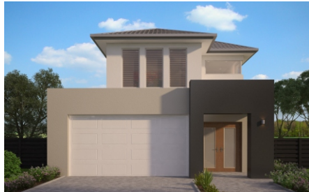
Optional facade available

Visit one of our display homes for more information. Full list of locations available on our website