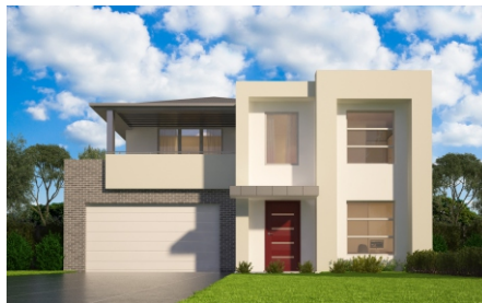
Optional facade available

Visit one of our display homes for more information. Full list of locations available on our website