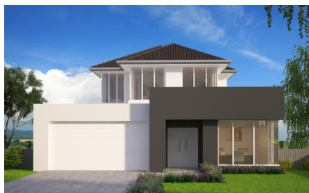
Optional facade available

Visit one of our display homes for more information. Full list of locations available on our website