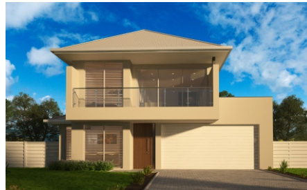
Optional facade available

Visit one of our display homes for more information. Full list of locations available on our website