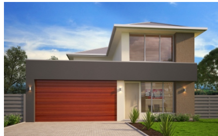
Optional facade available

Visit one of our display homes for more information. Full list of locations available on our website