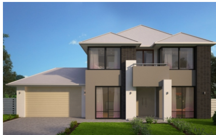
Optional facade available

Visit one of our display homes for more information. Full list of locations available on our website