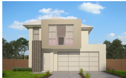
Optional facade available

Visit one of our display homes for more information. Full list of locations available on our website