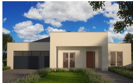
Optional facade available

Visit one of our display homes for more information. Full list of locations available on our website