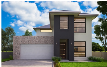
Optional facade available

Visit one of our display homes for more information. Full list of locations available on our website